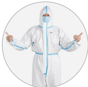
防护服 Medical protective clothing